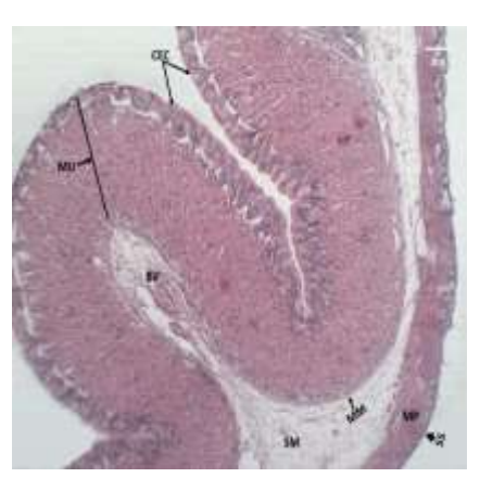
Fig. (1). Cross section in Nile tilapia stomach stained with H&E; showing stomach normal architecture in both control and treated groups; Blood vessel (BV), columnar epithelial Cells (CEC), mucosa (Mu), muscularis mucosa (MM), muscularis propria (MP), submucosa (SM), serosa (SS).

The examination of intestinal and stomach tissue sections revealed no striking macroscopic differences between control and other treatments ( Fig. 1 and 2 ). In addition, the liver tissue transverse sections examination showed, hepatocytes, hepatopancreas and central vein ( Fig.3 , a ).